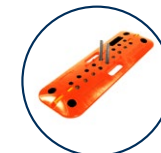
Heavy Duty Stand