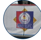
Photo-quality custom made fence screen for signage and advertising.